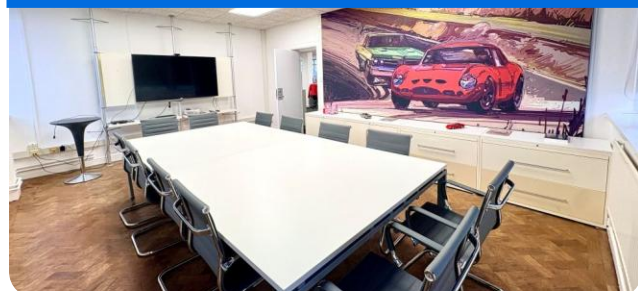
G103-110 Cherwell Business Village