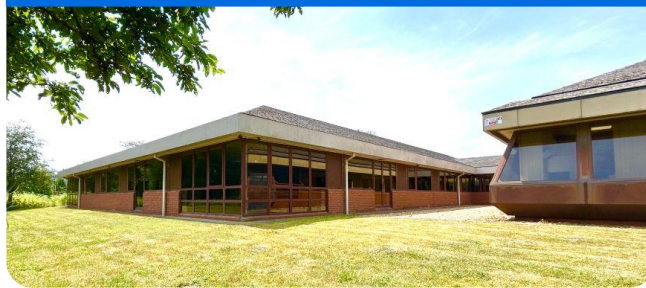
Former Innoval Building, Beaumont Close