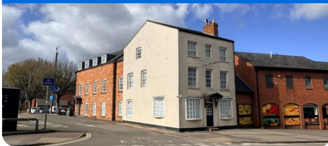
Globe House 55 Calthorpe Street