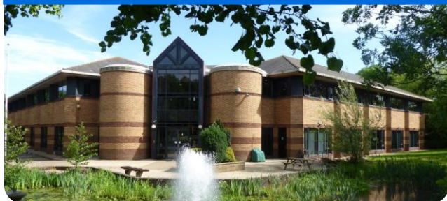
Pembroke House, Adderbury