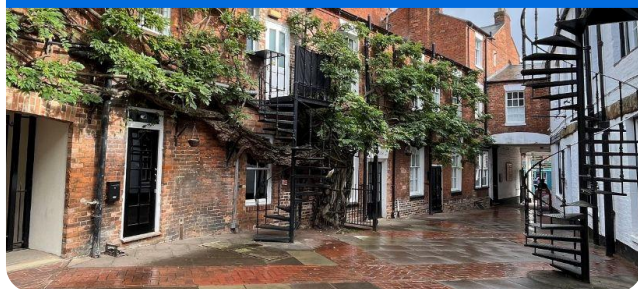
2B White Lion Walk