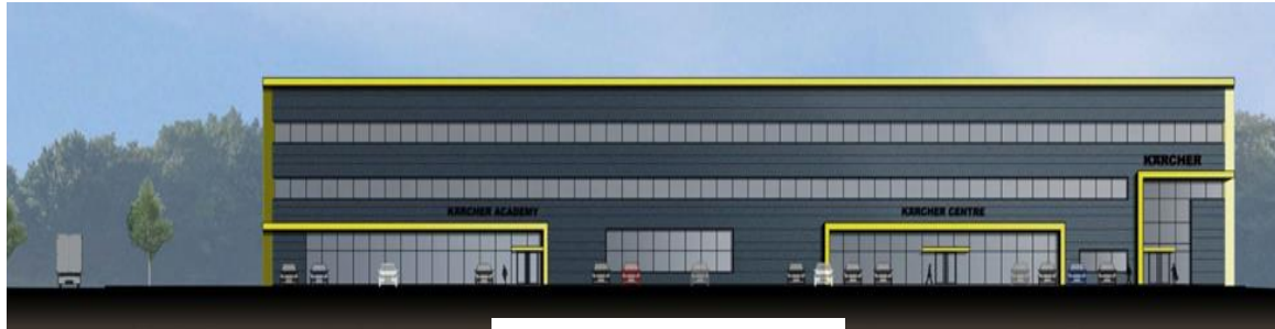
Proposed new building

PRESS RELEASE PRESS RELEASE PRESS RELEASE PRESS RELEASE