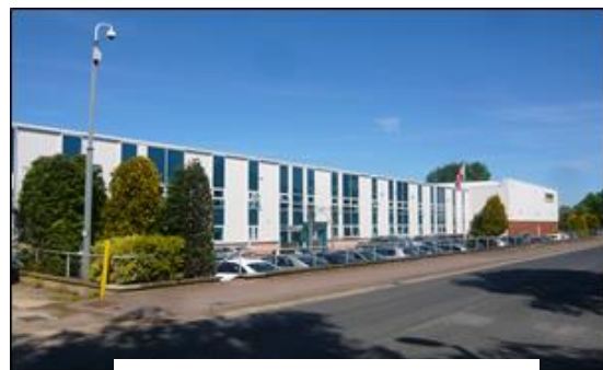
Current site in Banbury